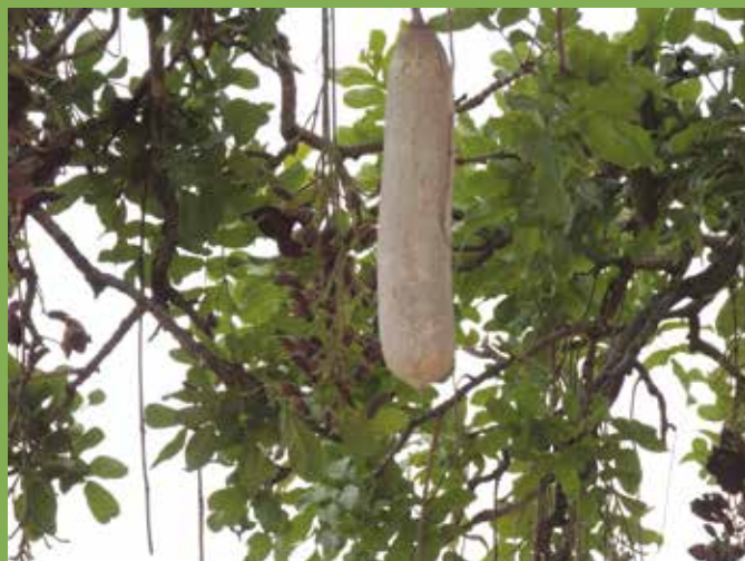
Photo 1: Sausage tree ( Kingelia africana ) in woodland of northern Namibia

Once the area has been chosen, the boundaries should be marked with boundary posts, especially so that cattle herders know to keep livestock clear. When there is a danger of trespassing and damage by grazing or browsing animals, a boundary fence should be established. Fencing is costly and therefore should only be erected when other means of protection will not be effective. A boundary fence could also be constructed from felled branches, like a kraal. Another option is to use a tree protector to protect the young trees from browsing mammals. Once a forest plantation is well established and the trees are sufficiently tall, the fences can be removed and re-used at another planting site.